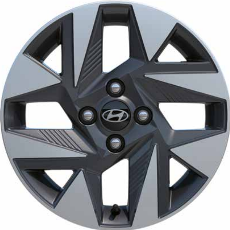
15" Alloy Wheel

Complement the sporty look with newly-designed 15" or 16"* alloy wheels for an energetic and agile look. A 14" steel wheel is available in the Classic model only.