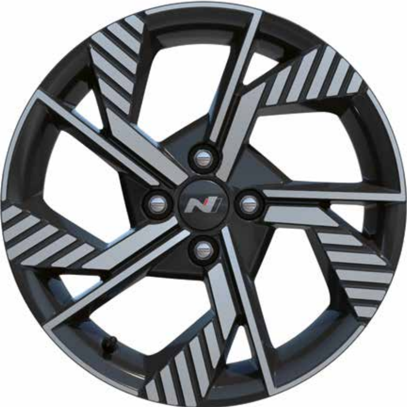
16" Alloy Wheel (N Line)*